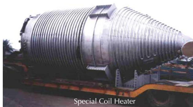
Special Coil Heater