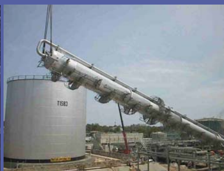
Column erected at Shell Refinery, Port Dickson