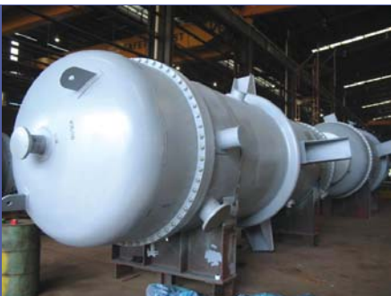
Falling Film Evaporator