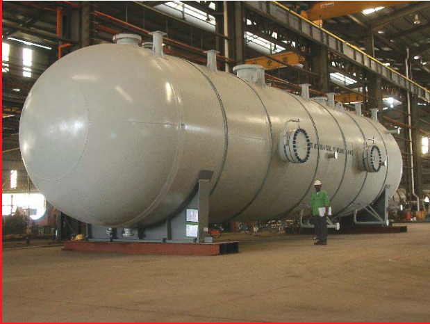
High Pressure Scrubber