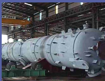
Carbon Steel Column for Petroleum Refinery