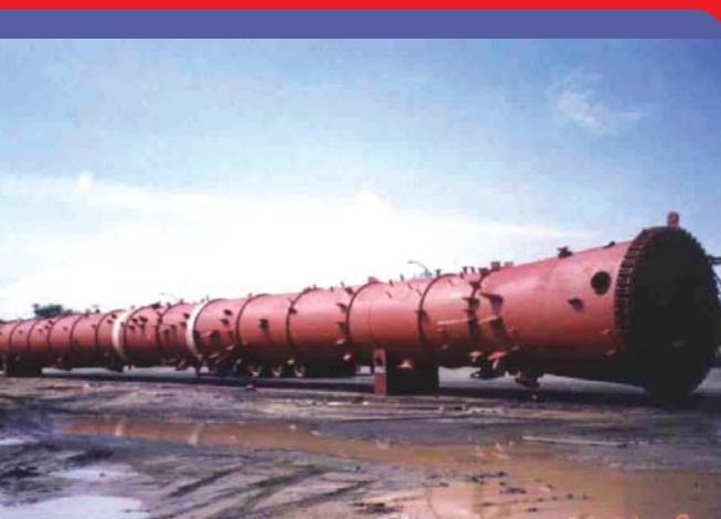
Carbon Steel Tray Column for Petroleum Refinery, Pakistan

The Board of Directors of APB Resources Berhad (the Board) is committed to the standard of corporate governance as prescribed in the Malaysian Code on Corporate Governance (the Code). The Board is committed to ensure that the highest standards of corporate governance are practiced throughout the Group to protect and enhance shareholder value and the financial performance of the Group.