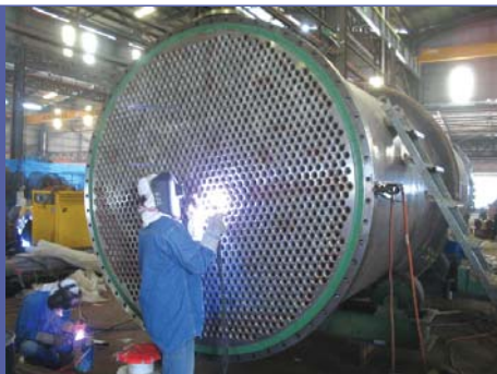
Tube welding to tubesheet in progress