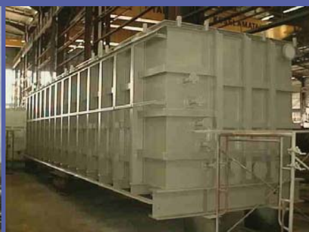
Waste Treatment Tank