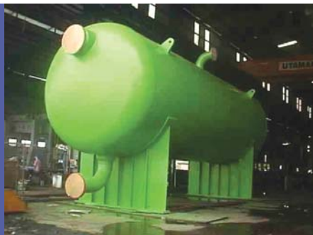
Low Pressure Separator

Finally, to my fellow Board members, I extend my appreciation and thanks for their continued support, guidance and contributions.