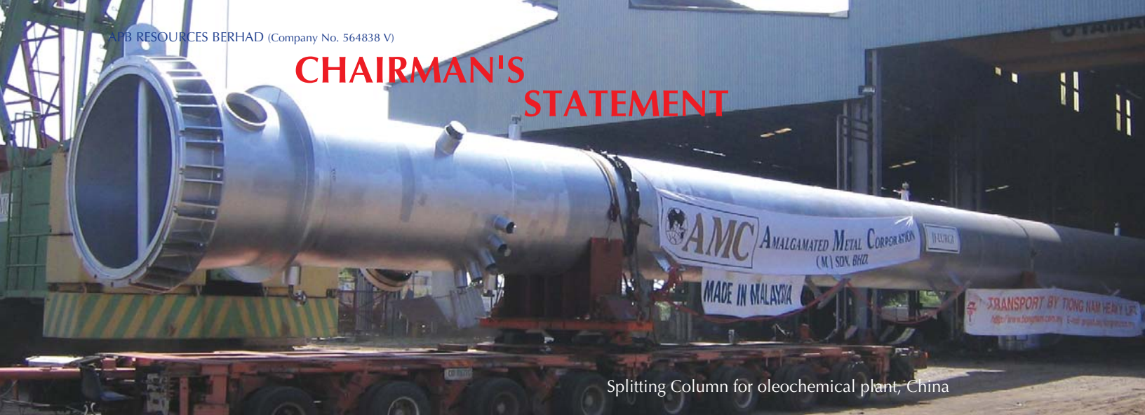
Splitting Column for oleochemical plant, China