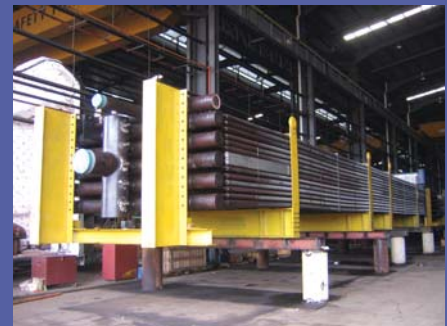
Heat Recovery Steam Generator for Power Plant